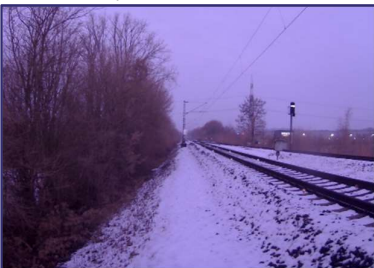
FlatMesh® Camera providing clear images 24/7

Due to Senceive's pedigree in providing monitoring solutions for both slopes and track bed within the rail industry throughout Europe and beyond, Deutsche Bahn selected Senceive's FlatMesh® system to monitor at-risk areas once the fissure had been filled in. This smart wireless system can be easily deployed in a matter of hours and allows the rail maintainer to see the relationship between slope and track.